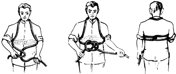
Fig. 339. Rigtig binding af sikkerhedsline.