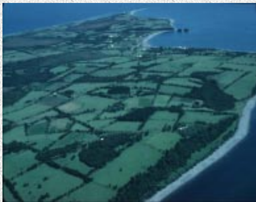
Island of TAC, Region de los Lagos, Chile