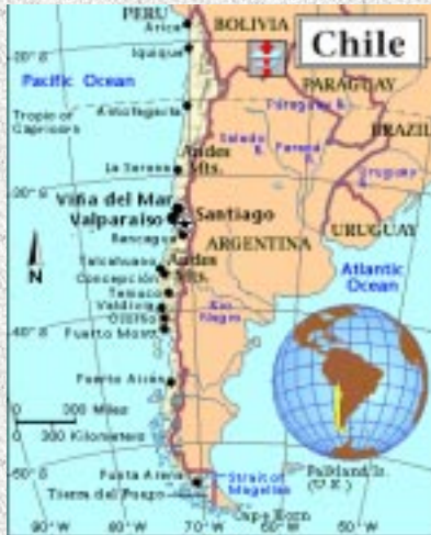
Unelectrified Population = 861,000, primarily in the southern regions