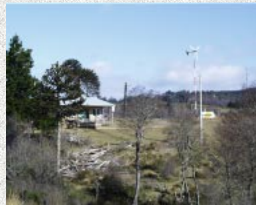
Village of Villa Las Araucarias and the installed power system