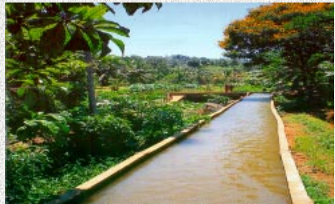
Micro-hydro electric power station provides clean, safe energy in Sri Lanka.

Total World Bank/GEF support is US$30 million