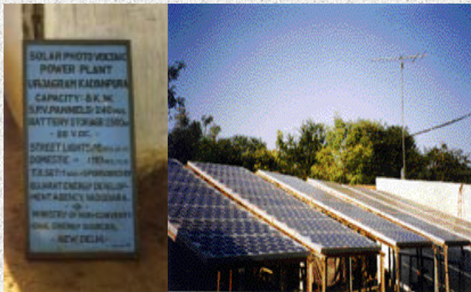
Renewable energy: making a difference in India

The India Renewable Energy Development Loan promotes the commercialization of renewable resources technologies; creates marketing and financing mechanisms for system sale and delivery; encourages private-sector investment in small-scale power generation; and promotes environmentally sound investments.